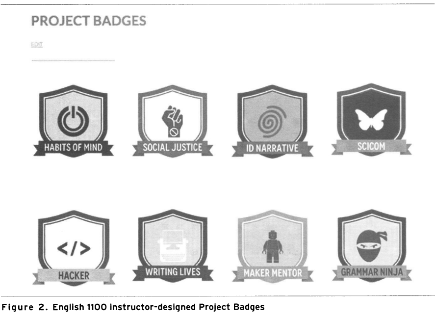
Figure 2. English 1100 instructor-designed Project Badges

my course is now directly tied to badges. Students are required to earn all eight student-designed Habits of Mind Badges to pass the course and can choose to complete any combination of the Project Badges according to the grade they are seeking. Students who desire an A must earn the eight Habits of Mind badges and four Project Badges, while those seeking a C would earn all eight Habits of Mind badges and two Project Badges.